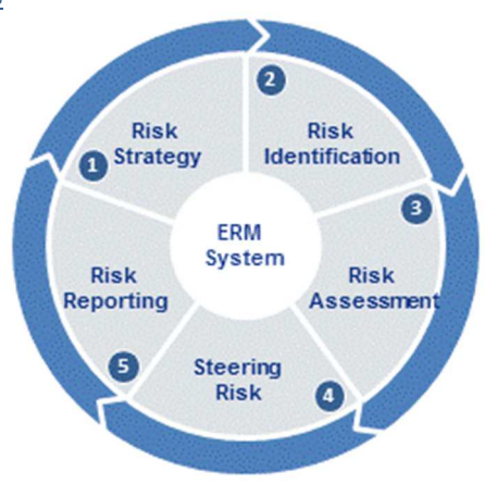
Figure 8: ORSA macro process

The ORSA process is executed through five main steps: