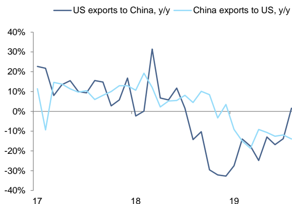
Figure 2 – Bilateral trade between the US and China, y/y